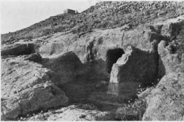
A closeup of the entrances to two plundered tombs at Zafar.

part animal and part plant, and a fragmentary relief of Hercules in a lion-skin cloak. These photos of the objects should add considerably to our knowledge of Himyarite archeology, much of which shows a strong Greco-Roman influence consistent with what we know of the site and its historical context.