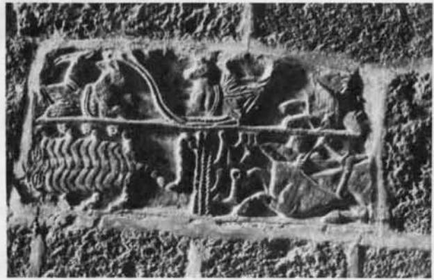
Plaque showing mythical creatures—a leaf-donkey, a scorpion, and a centaur,

Like much of the Near East Yemen is presently enjoying considerable prosperity, with the result that ancient remains are being torn down at an alarming rate as the modern inhabitants scavenge for building material and clear new areas for farming. Villagers at Zafar regaled us with stories of how Himyarite material used to be sold for one riyal (25¢) per camel load. In the face of such a situation, we