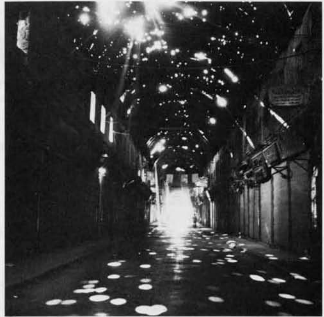
Inside the suq at Damascus.

In order to accommodate the two exhibits, the Palestinian gallery is being cleared and redecorated; this has provided the opportunity to re-organize the Palestinian material, and to include a number of new